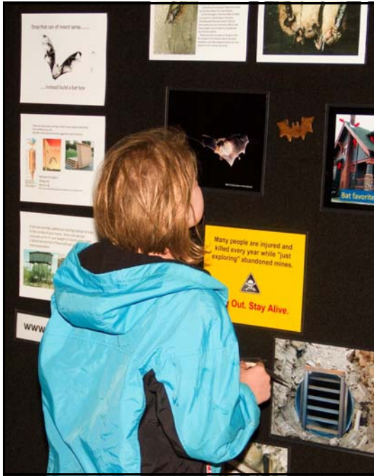
Display boards helped cover bat-related topics.

Over 50 bats were counted emerging from the bat house next to the Tatanka Theatre.