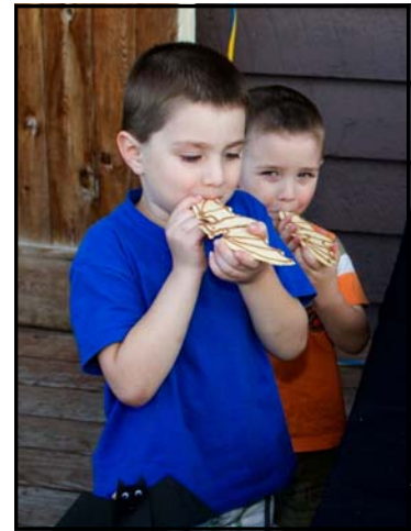
Bats are delicious!