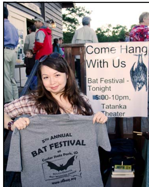
T-shirts were popular this year as well.