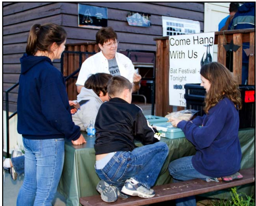
The build-a-bat station was popular with the younger festival-goers.